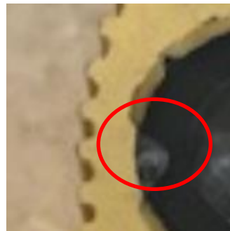
HS25 – 50 current – above