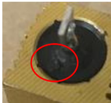
HS25 - 50 - moulded using new tooling